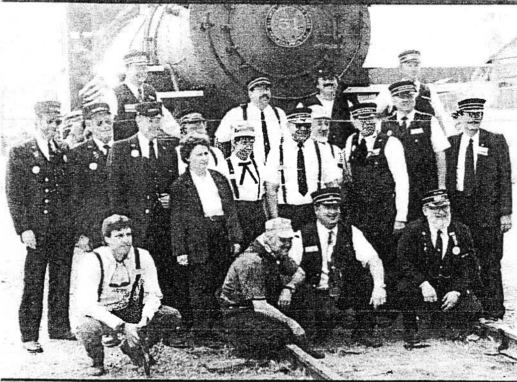
Santa's helpers? Well maybe. How about a shot of the Fillmore & Western #51 steam train crew and SCRVRHS Car Attendants from the Society's very first Spring Rail Festival back in 1995! Many of these faces and more will be at the Holiday Pot-Luck.